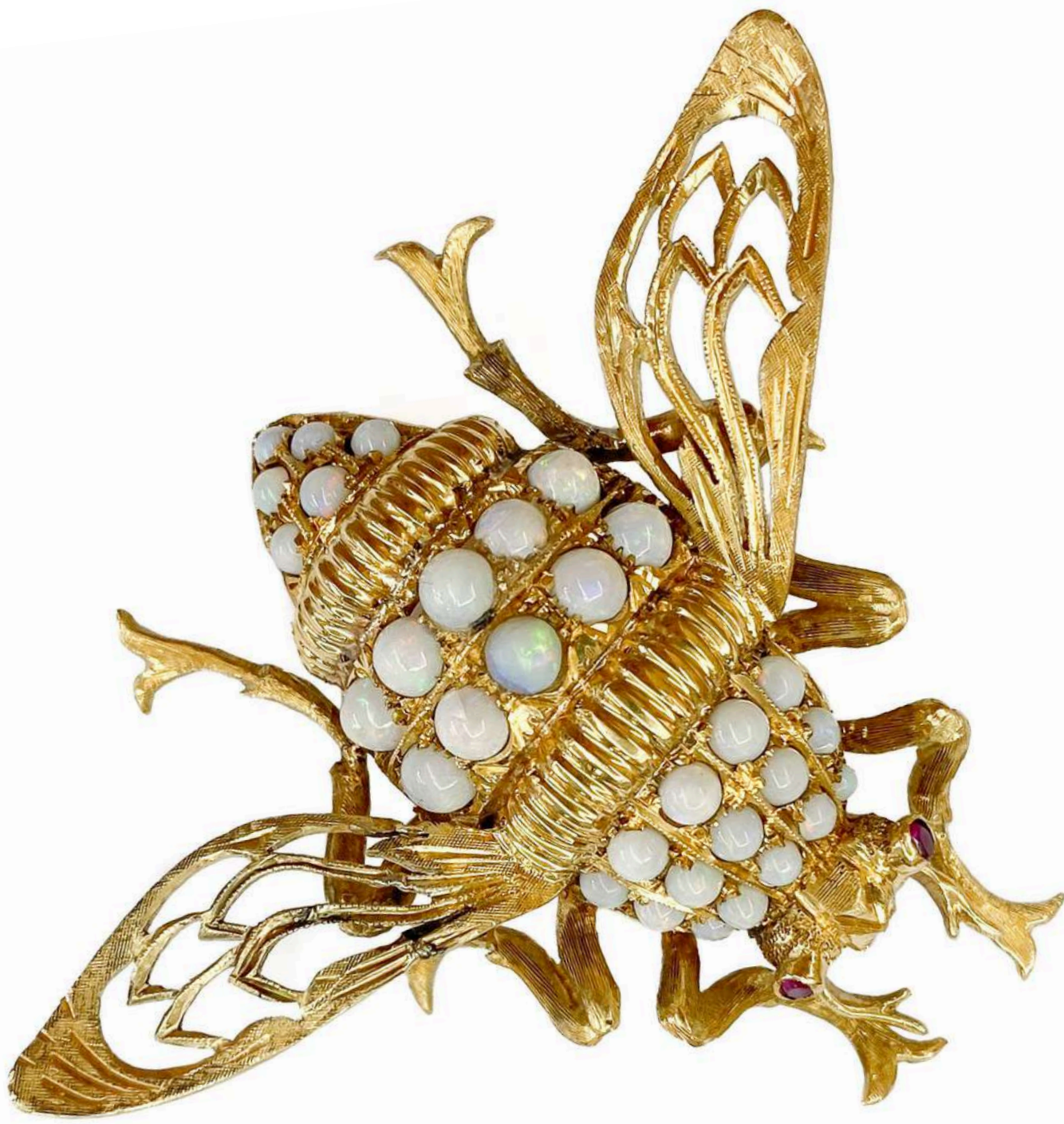
Up: 18 karat yellow gold brooch Italy, 1960s

Gold has long been regarded as a safe investment, and its price has fluctuated significantly throughout history. The global economy has been based on the 'Gold Standard', which linked the amount of money in circulation to a country's gold reserves.