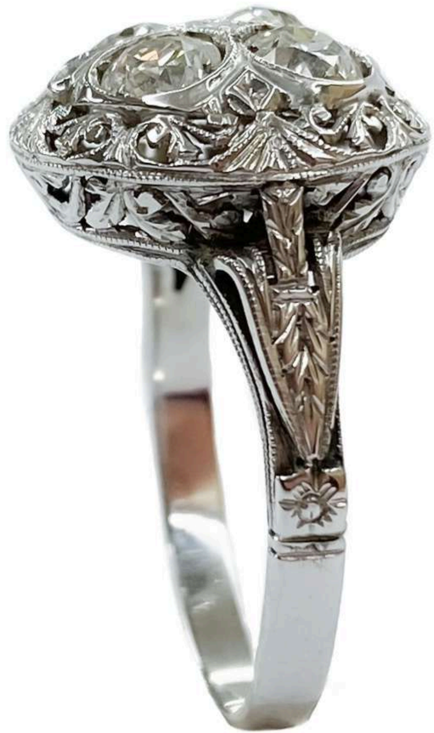
18 karat white gold ring Italy, 1910s

This system was abandoned in 1971, allowing gold prices to fluctuate freely in the market. An extraordinary increase in gold prices followed: between 1970 and 1980 gold went from about €1 per gram to a peak of over €18 per gram, adjusted to today's Euro value.