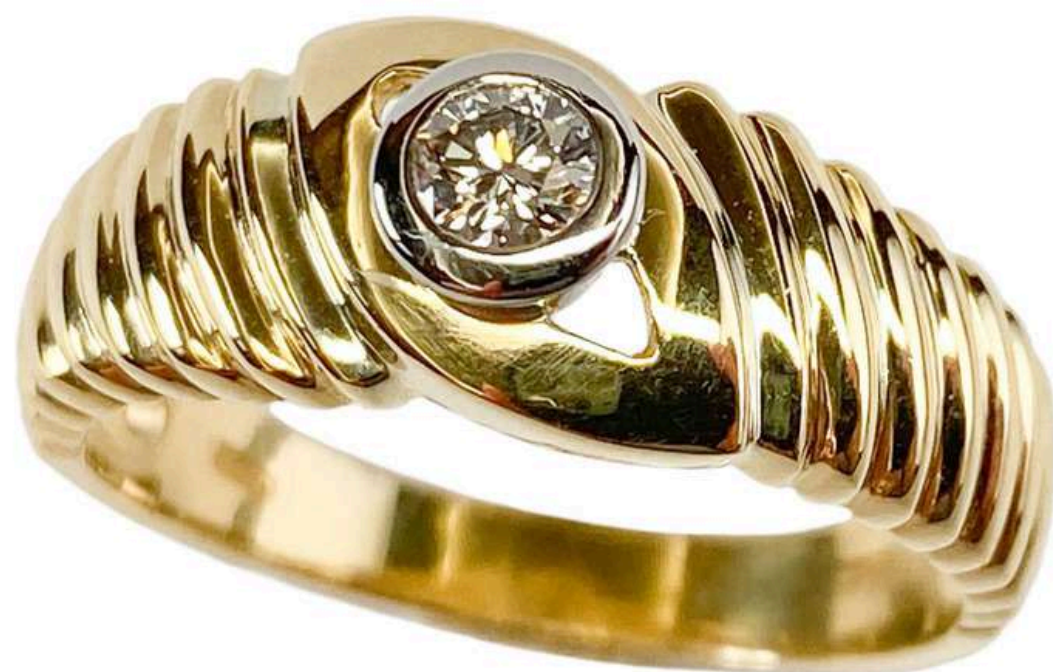
Righ: 18 karat yellow and white gold ring Italy, 1980s

Gold can also be found in Italy in rivers such as the Po and the Ticino, which were the supply points for the ancient Romans, but there are also primary gold deposits. The largest of these is in Monte Rosa, which, for both environmental and cost reasons, it is not being exploited.