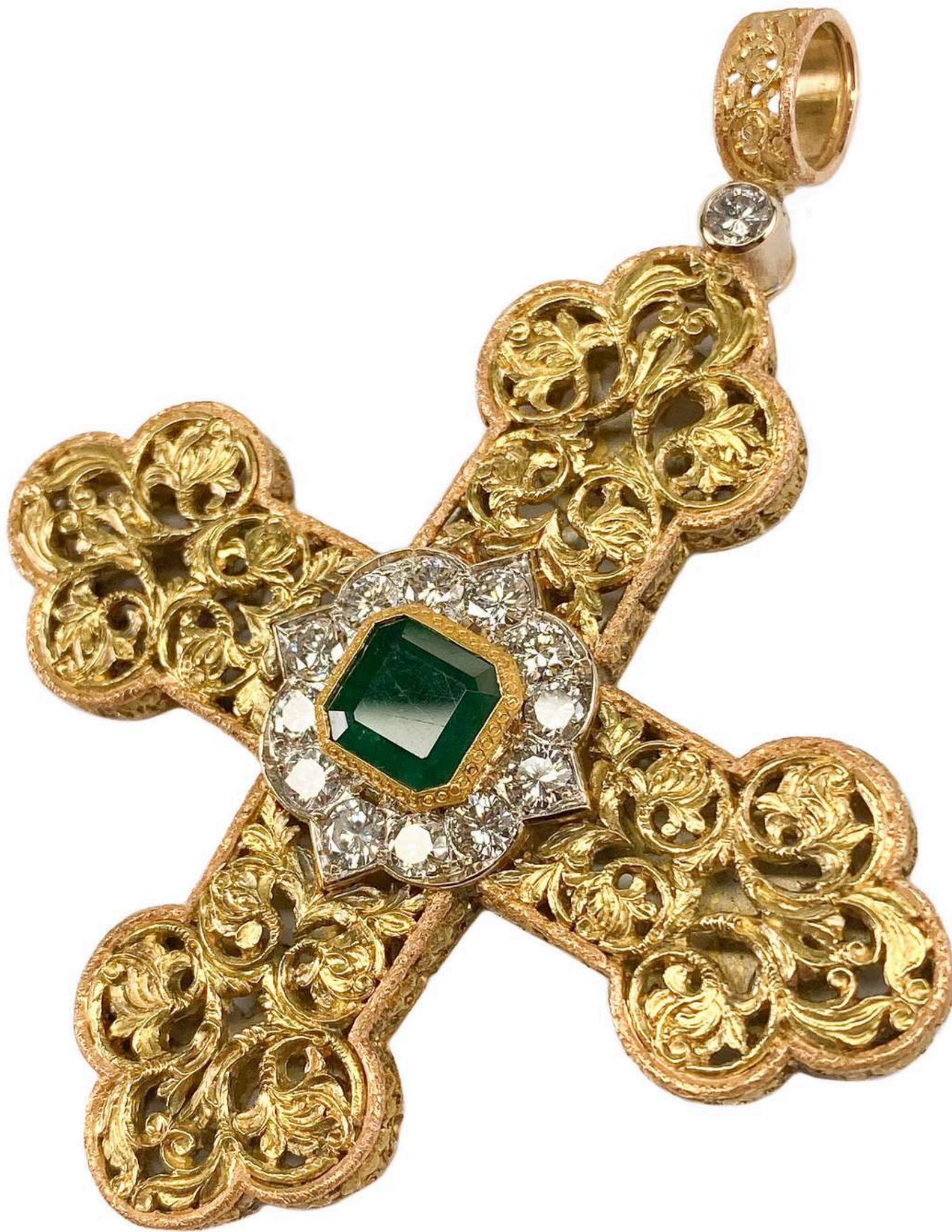
18 karat yellow gold pendant Italy, 1960s

As a symbol of purity, value and loyalty but also, inevitably, of opulence and wealth, gold has always been the most valued metal among humans because it is perfect for making ornaments and jewelry as well as ritual symbolic objects, and technical instruments. Its Latin name Aurum gives rise to the chemical symbol Au, which belongs to Group 11 of the periodic table of elements and has atomic number 79.