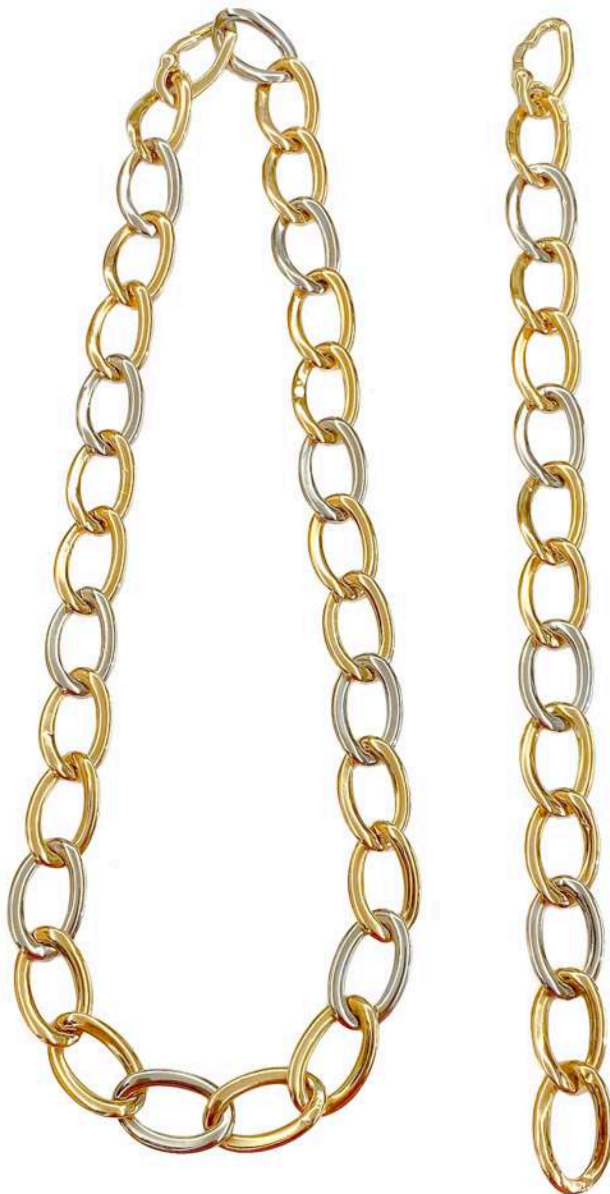
18 karat yellow and white gold demi-parure Italy, 1970s

Gold has been known to human since prehistoric times and was the first metal they used, a significant fact considering that it was not used for making everyday utensils nor weapons. Throughout the centuries, all civilizations have used this metal as a trade commodity and for ornamentation. The ancient Egyptians describe it as “common as dust” because it was abundant along the banks of the Nile and its tributaries; the Old Testament contains many references to this metal, and in the Bible it is even presented as a symbol of Christ's kingship, brought to him as a gift by the Magi. Gold also holds an essential position in Buddhism, where it is considered one of the seven treasures and equated with faith or righteous belief.