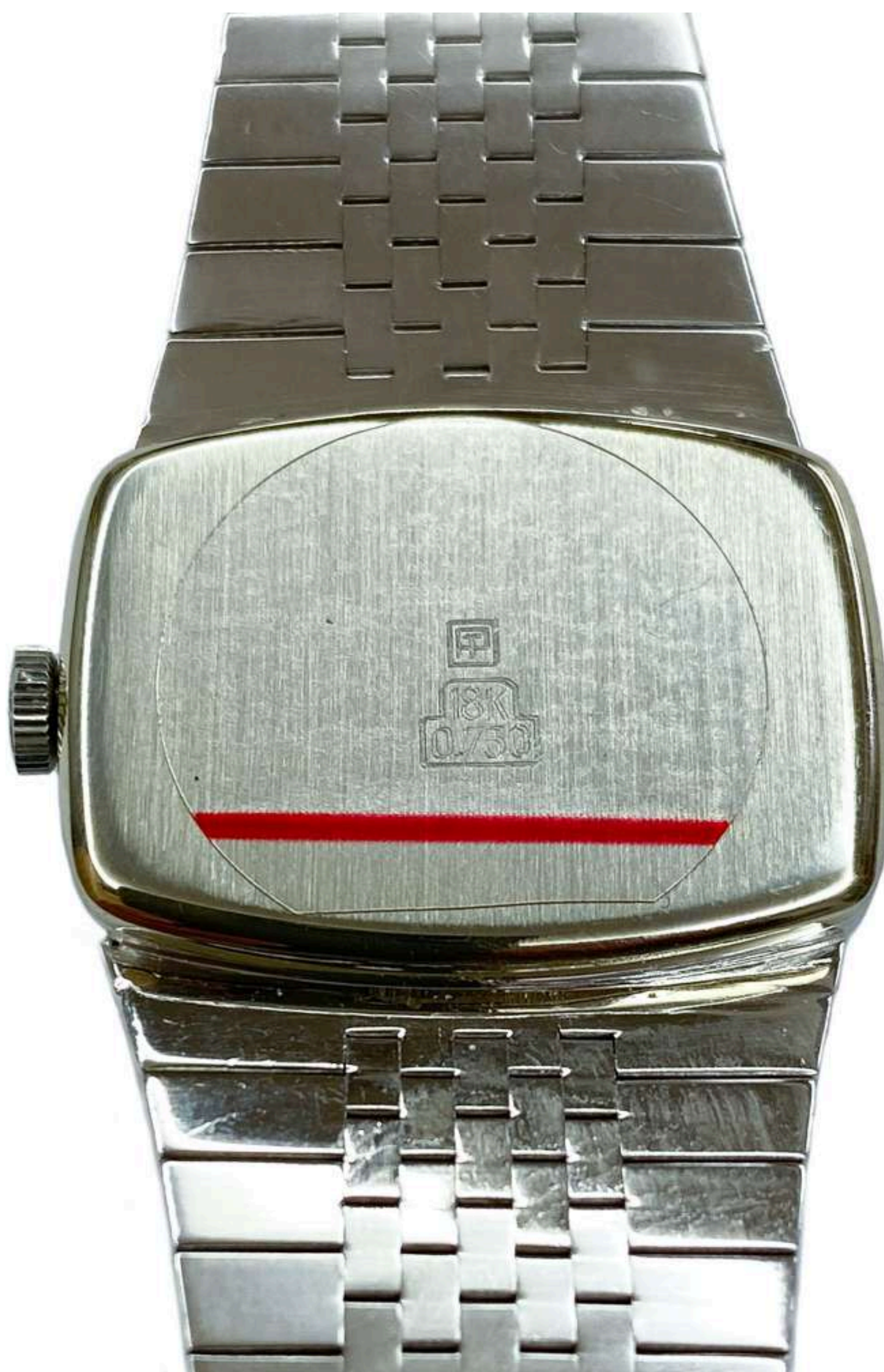
Zenith watch made in 18 karat white gold Switzerland, 1960s

To verify a gold jewelry piece and its karat value, several methods can be used. Some of them, however, are “homemade” and unreliable to be considered valid. A professional assessment is crucial in this circumstances. The first step is checking for the hallmarks which indicate the gold’s purity. In Italy, market transparency laws mandate that the precious metals display their finest using a stamp. An 18 karat gold piece will bear the 750 hallmark, enclosed in a horizontal lozenge, often found in discreet areas such as the inner band or a ring.