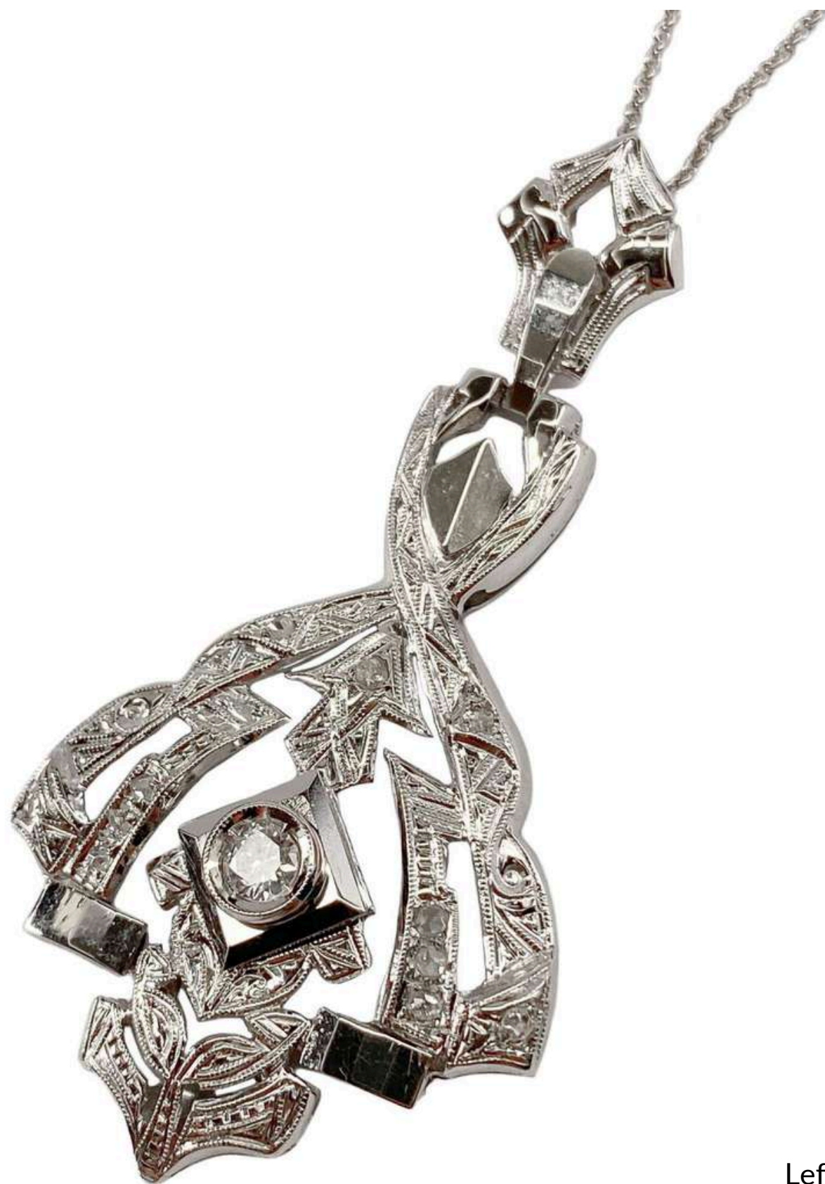
Up:18 karat rose gold bracelet Italy, 1940s Left:18 karat white gold necklace Italy, 1930s

Gold alloys also allow for different color variations in jewelry, as yellow is the only natural hue of pure gold. Starting from the formula for creating yellow gold, and increasing the amount of copper, at the expense of silver, gold develops pinkish and eventually red tones. White gold, on the other hand, still consists of 750 parts gold, but the remaining 250 parts are made up of palladium or platinum - historically, nickel was also used.