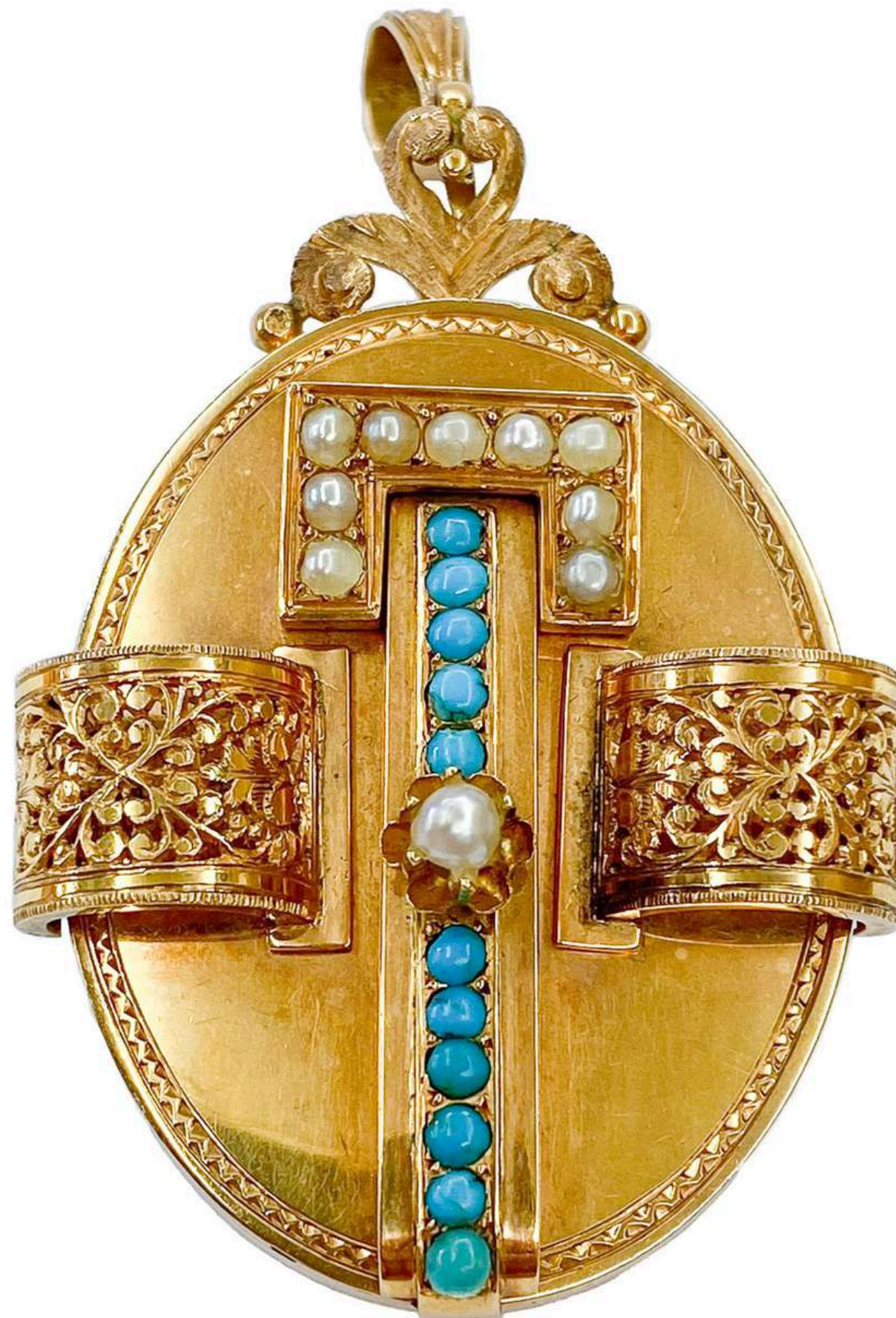
18 karat yellow gold pendant - brooch Austria, 19th century

Although often overlooked, the medieval period saw extensive use of gold in the decoration of major churches, chapels and palaces. It is also undeniable that the explorations of the Americas, after Columbus' first landing in 1492, were driven primarily by European explorers' fascination with the tales of the gold jewelry possessed by native peoples and the possible presence of huge deposits in the "new lands."