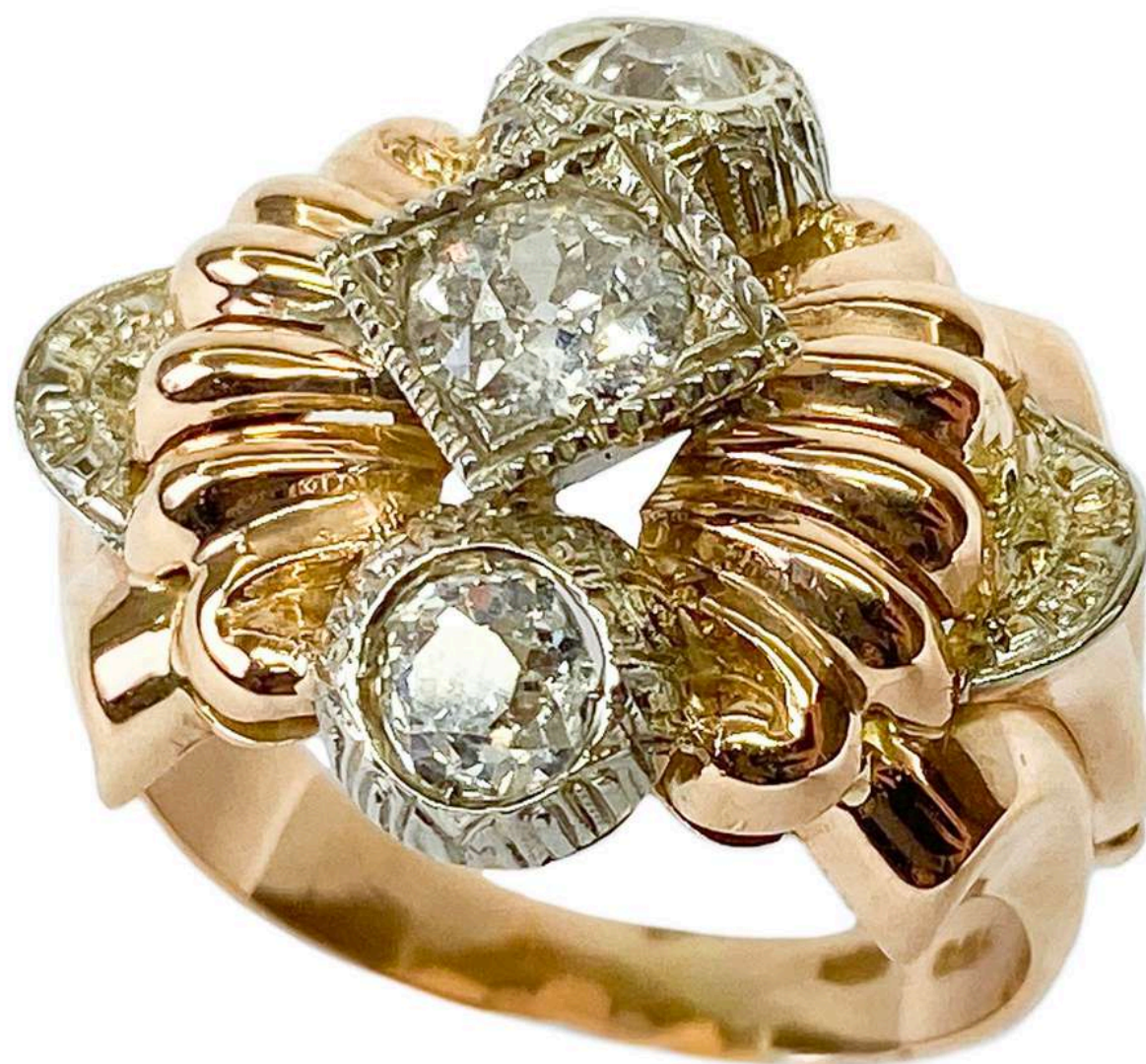
Up: 18 karat red and white gold ring Italy, 1940s

The political instability of the 2000s led to a rapid rise in the price of gold, which stabilized over an extended period at an average level of €40 per gram, reaching a peak at €44 in 2011.