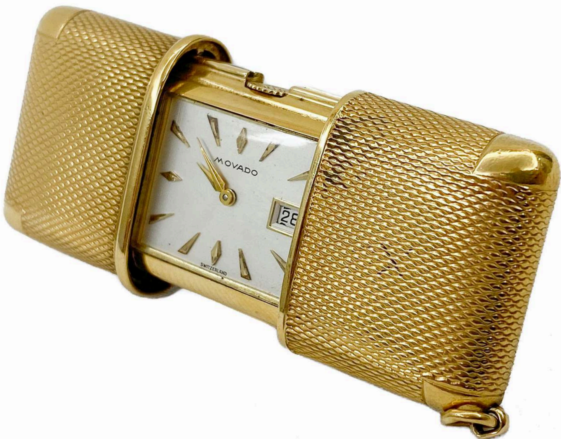
Movado clock made in 18 karat yellow gold Switzerland, 1950s

Gold is found in two types of deposits. Primary deposits contain gold embedded in other rocks and minerals, such as quartz; while secondary deposits are alluvial accumulation resulting from the erosion of primary rocks. Here, gold appears as flakes, grains or larger agglomerates known as gold nuggets. However, due to its great ductility, pure gold cannot be used in jewelry because it is too soft and prone to deformation or damage.