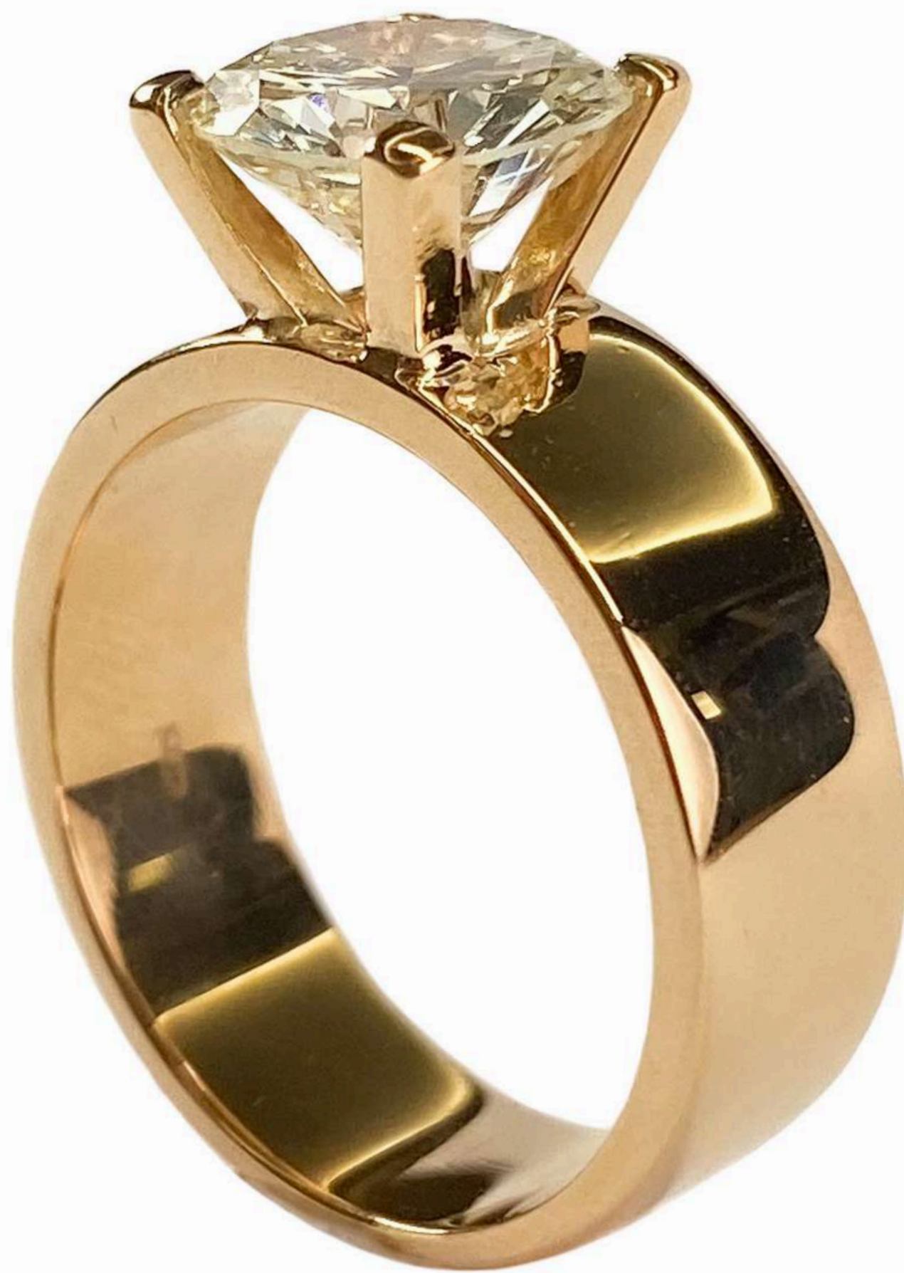
18 karat yellow gold ring Italy, 1980s

However, to provide a definitive assessment, one must test the item with a specific acid. As mentioned, gold is a metal that is virtually unaffected by most agents, including acids, so when exposed to these specialized solutions, gold remains unchanged, while all its imitation will either change color or corrode.